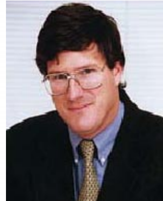
Scott Ritter Former United Nations Chief Weapons Inspector In Iraq

MONDAY, JANUARY 19TH 3:30 UNTIL 6:30 PM UNIVERSITY OF THE DISTRICT OF COLUMBIA MAIN AUDITORIUM