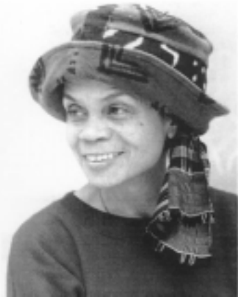
Sonia Sanchez Renowned Poet, Author and Activist